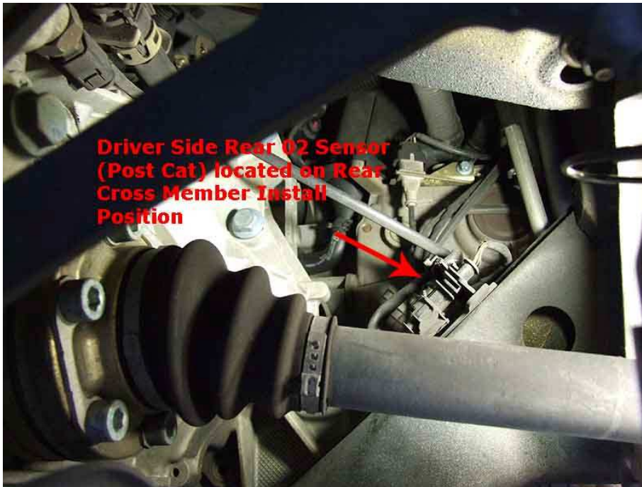
Driver Side Rear O2 Sensor (Post Cat) located on Rear Cross Member Install Position