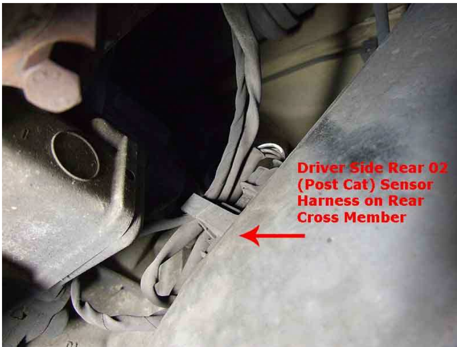
Driver Side Rear O2 (Post Cat) Sensor Harness on Rear Cross Member